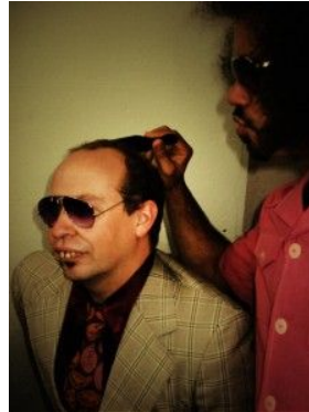
Brazilian hair Do - 1976

Here are the names we appeared under during the great Brazilian tour of 1976.